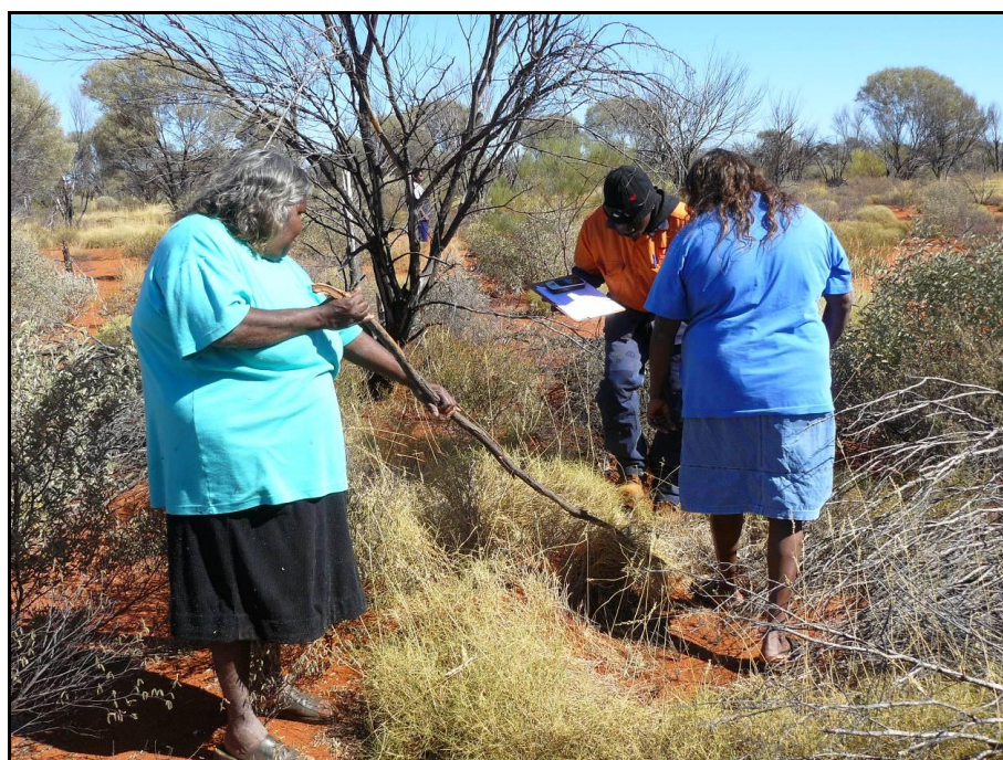
Figure 2 - Mulgara Survey at C Regional.

An ethnographic survey over areas that may be required for infrastructure and waste dumps was completed during the Quarter, with no significant ethnographic sites identified.