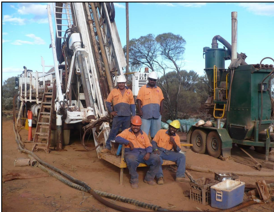
Figure 1 - RC drilling at Wiluna West.

During the June Quarter 2009 a total of 170 RC holes were completed for 16,469m, as summarised in Table 1.