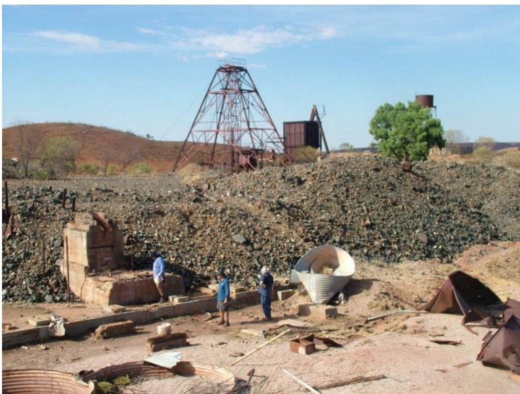
Figure 2, Pioneer Mine

There are a large number of historical mine workings with much of the recorded previous production coming from six groups of historical mine workings spread over an area of 20 km 2 . Historical production was at grades of 1% to 12% WO 3 , averaging 2.5% WO 3 , with the largest contributor being the Pioneer Group (Figure 2). The mines exploited quartz veins containing wolframite and to a lesser extent scheelite, bismuth and copper.