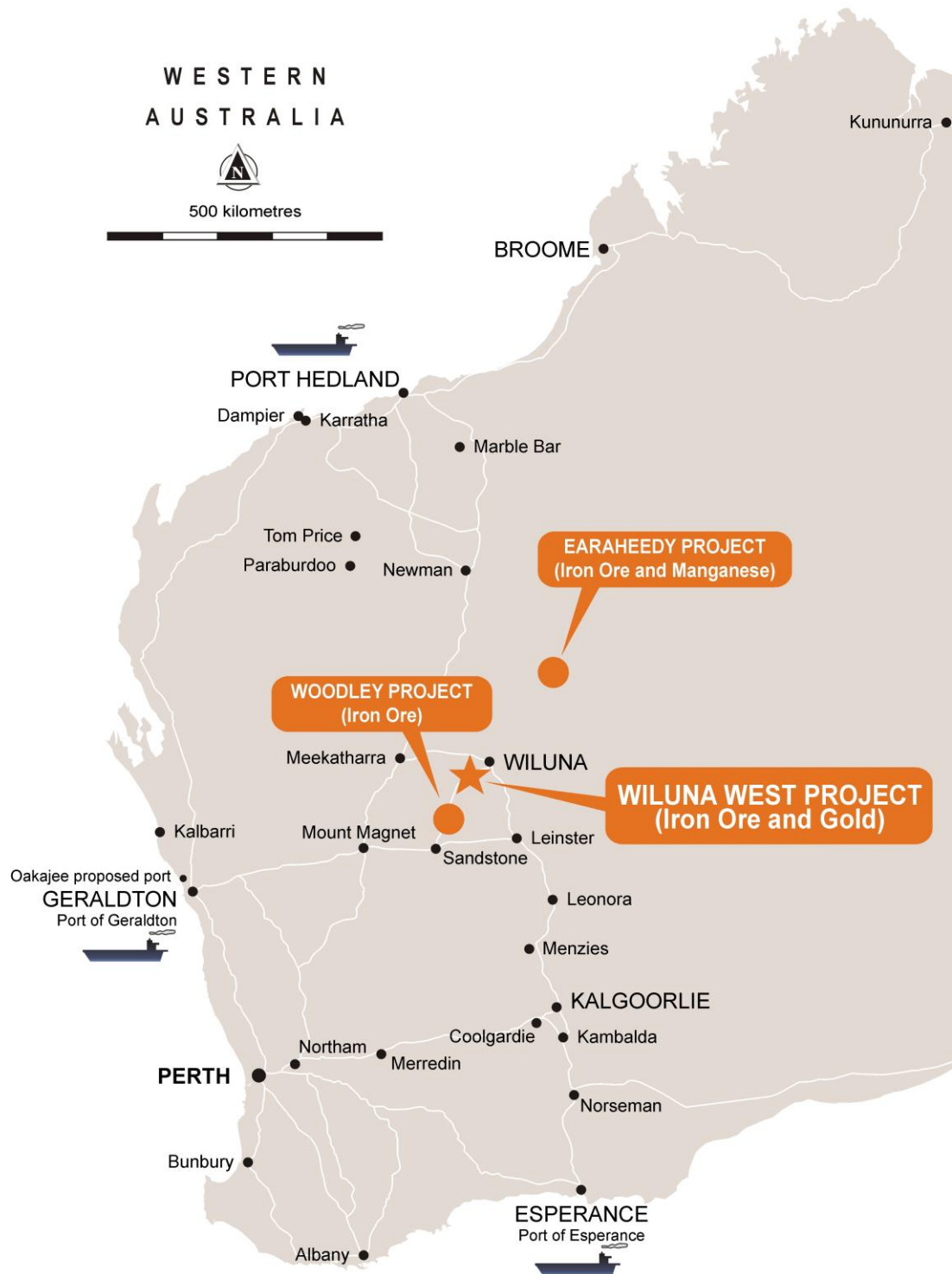
Figure 1: GWR Project Location Map